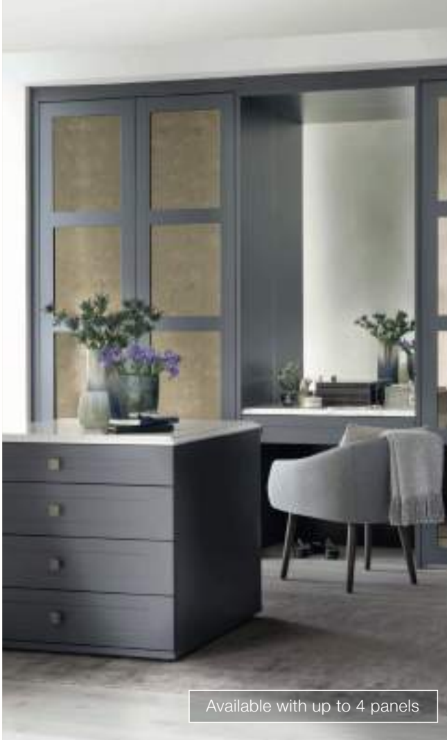
Available with up to 4 panels